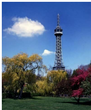
Petřín look-out tower in Prague