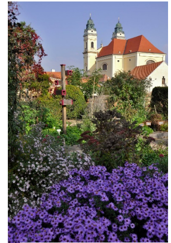
L&T Chmelar Herb Garden at Valtice Chateau