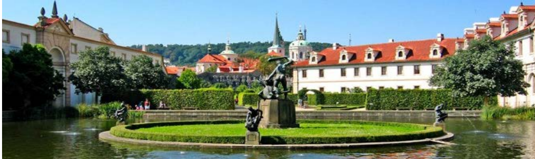
Wallenstein Garden in Prague