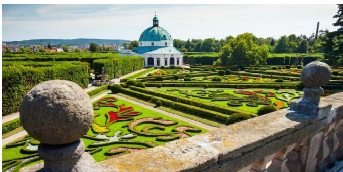
Archbishop Palace and Gardens in Kroměříž

Our tour will explore the works of landscape architecture inherited from the old Austro-Hungarian Monarchy to later developments including the new designs at the forefront of sustainability. This includes buildings and landscapes that were preserved and nominated as UNESCO World Heritage Sites through the efforts of the World Monuments Fund.